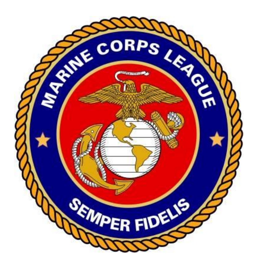
Department of Iowa Marine Corps League Bylaws